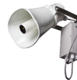
Audio Voice Down and Blue Light

Allows users to remotely control the power to a Pole Camera