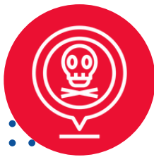
Location of Crime