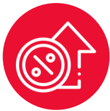
Rate of Crime

When bidding for surveillance camera funding, quantitative data such as crime rates, crime locations, types of crime, and the impact of crime is incredibly powerful information.