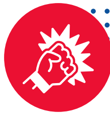
Type of Crime