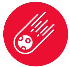
Impact of Crime

Where possible, you should reference any previous successes your department has achieved by utilizing similar systems.